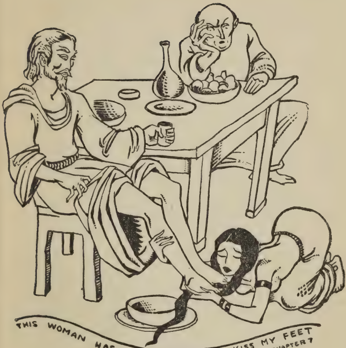
THIS WOMAN HAS NOT CEASED TO KISS MY FEET ST. LUKE CHAPTER 7 VERSE 45